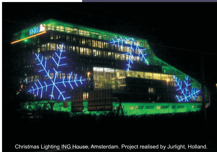
Christmas Lighting ING House, Amsterdam. Project realised by Jurlight, Holland.